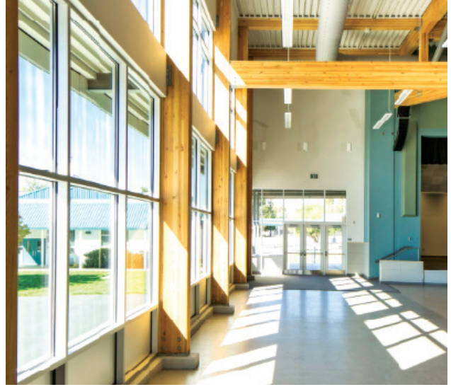
At Morris E. Ford Middle School, exposed wood columns are raised off the floor to protect against moisture.