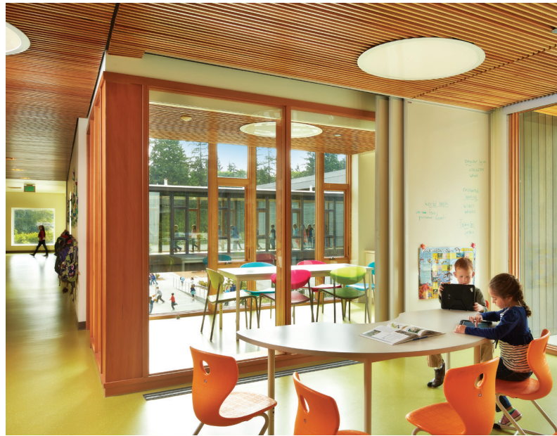
Wilkes Elementary School / Bainbridge Island, WA Mahlum Architects

While gypsum wallboard is often used as a finish in wood-frame wall assemblies to meet criteria such as fire resistance and acoustics, it is prone to damage from impact, scratches, and moisture. It is easily repaired in patches, but this can be costly and time consuming, and is less than ideal for school facilities.