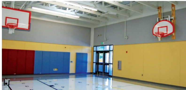
At Shining Mount Elementary School, corridor wall finishes include MDF, vinyl and gypsum. MDF is also used on the lower section of gymnasium walls.

in Hot Springs, Arkansas explained why this detail was chosen for one of their school facilities. "We worried about kids knocking holes in the gypsum wallboard. We easily overcame that by installing OSB [oriented strand board] over the wood studs and then covering it with impact-resistant gypsum to provide protection."