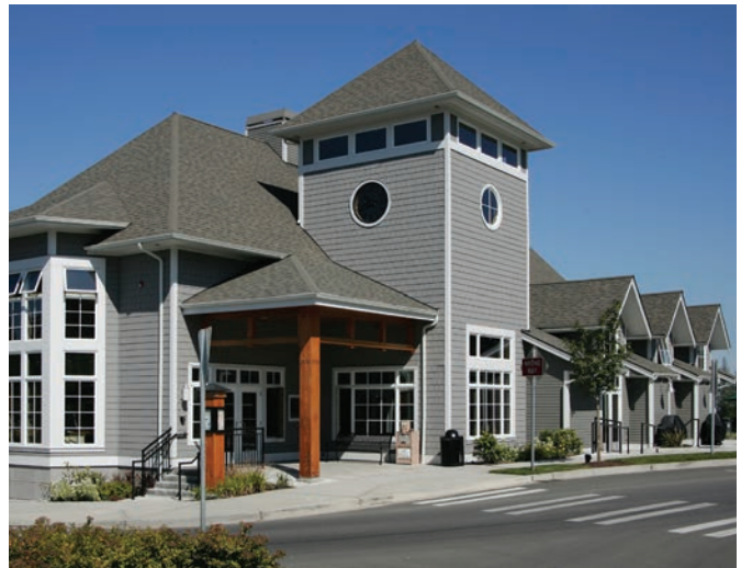
Blakeley Hall in Issaquah, WA was assessed using the Green Globes rating system and achieved two Green Globes.

In Japan, for example, the Ministry of Education has an ongoing initiative to use wood structural materials and finishes in schools based on the belief that it has a positive impact on students. For similar reasons, the Thunder Bay Regional Health Center recently became the first hospital in Canada to gain approval for the use of wood as a primary structural element.